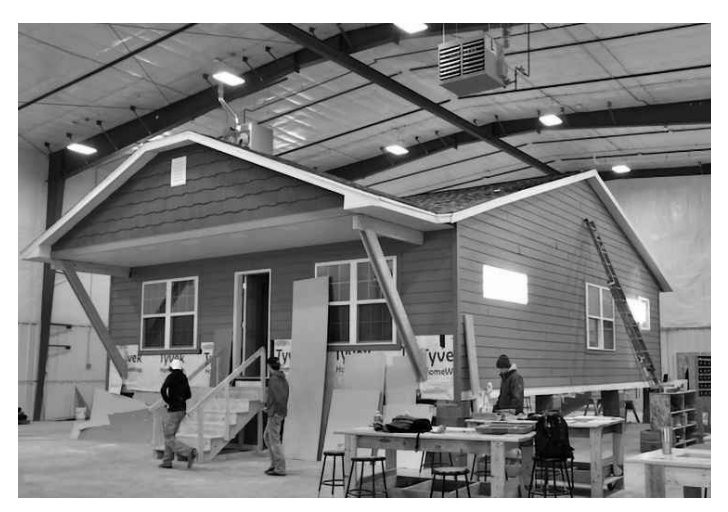
Students in the Harrisburg School District's home builders academy have built a full house.