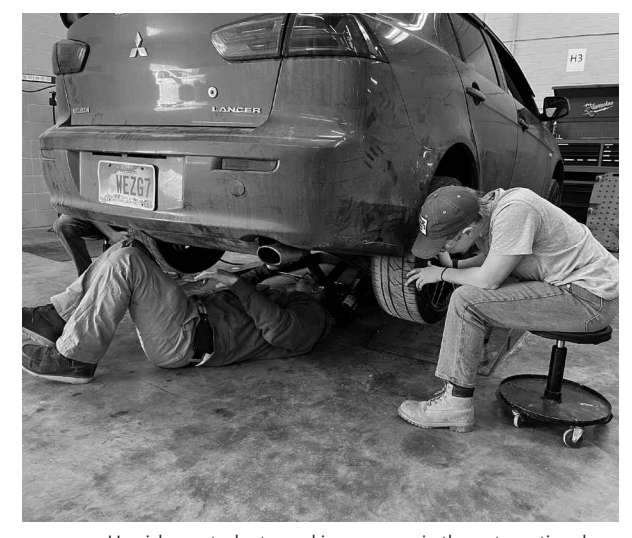
Harrisburg students working on a car in the automotive class.

"Statewide, 82% of high school students graduated on time in the 2021-22 school year, but 94% of students who were actively involved in CTE graduated on time," she