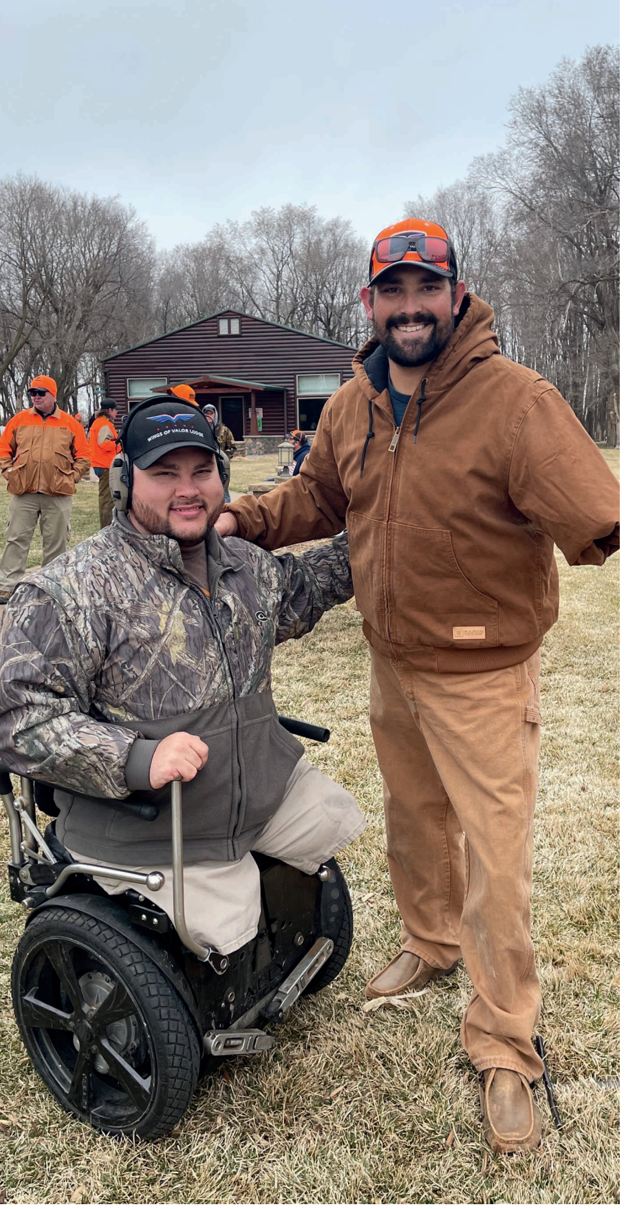
Veterans enjoying their stay at Wings of Valor.