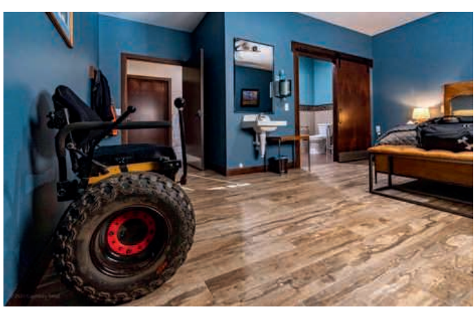
A handicap accessible bedroom at Wings of Valor lodge

To apply for a hunt or learn more about Wings of Valor Lodge, go to www. wingsofvalorlodge.org.