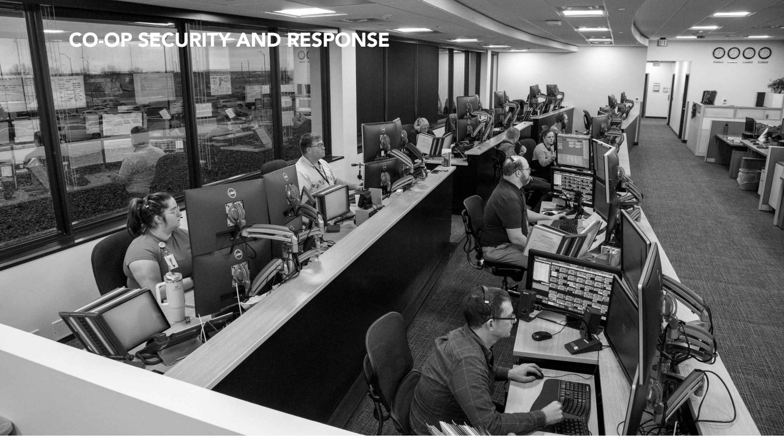
Basin Electric Security and Response Services dispatchers take calls from rural electric cooperative members at Basin's headquarters in Bismarck, N.D.