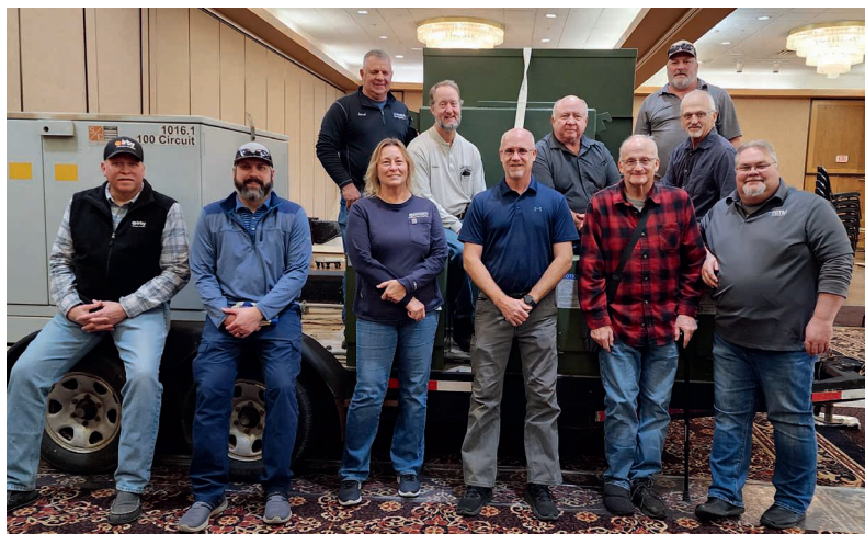
2023 SDREA Meter School Instructors

Your electric cooperative is your partner in getting it done!