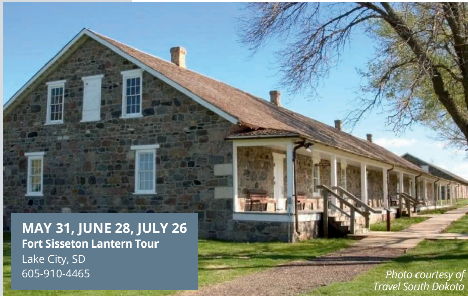
MAY 31, JUNE 28, JULY 26 Fort Sisseton Lantern Tour Lake City, SD 605-910-4465