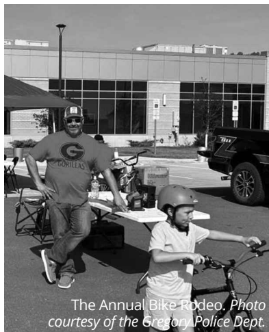
The Annual Bike Rodeo.