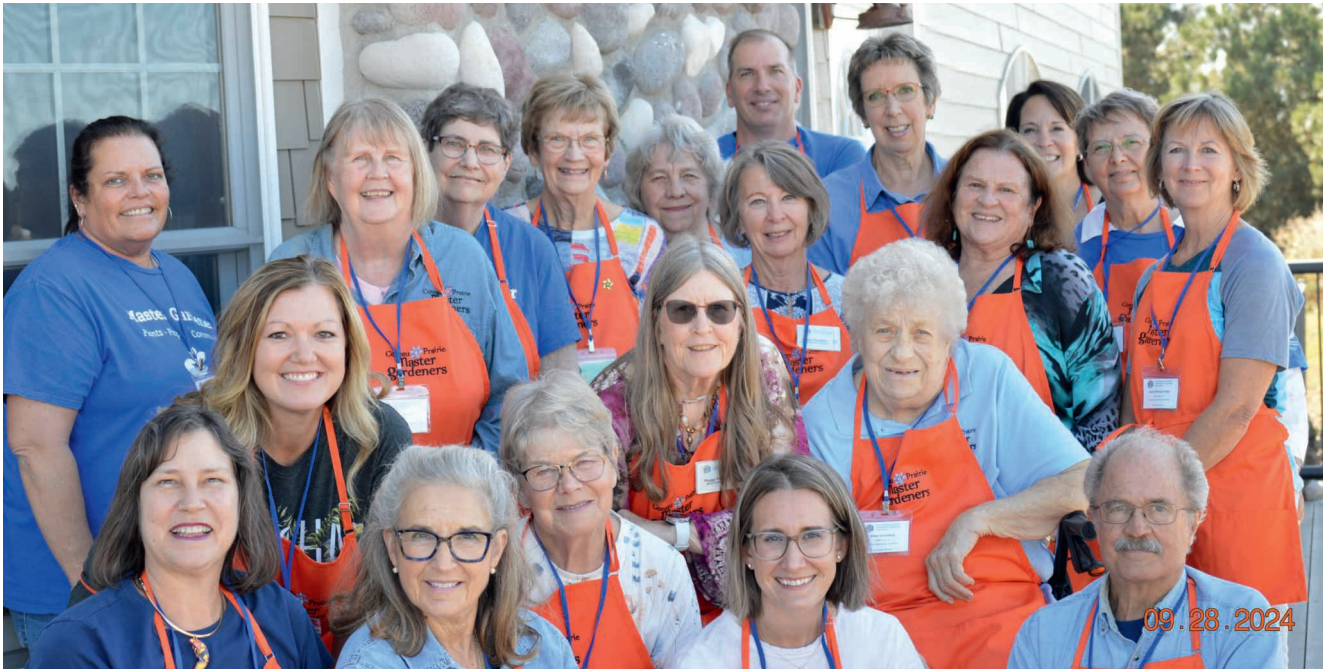
Coteau Prairie Master Gardener Club (Watertown area) hosted the 2024 state conference at Joy Ranch.