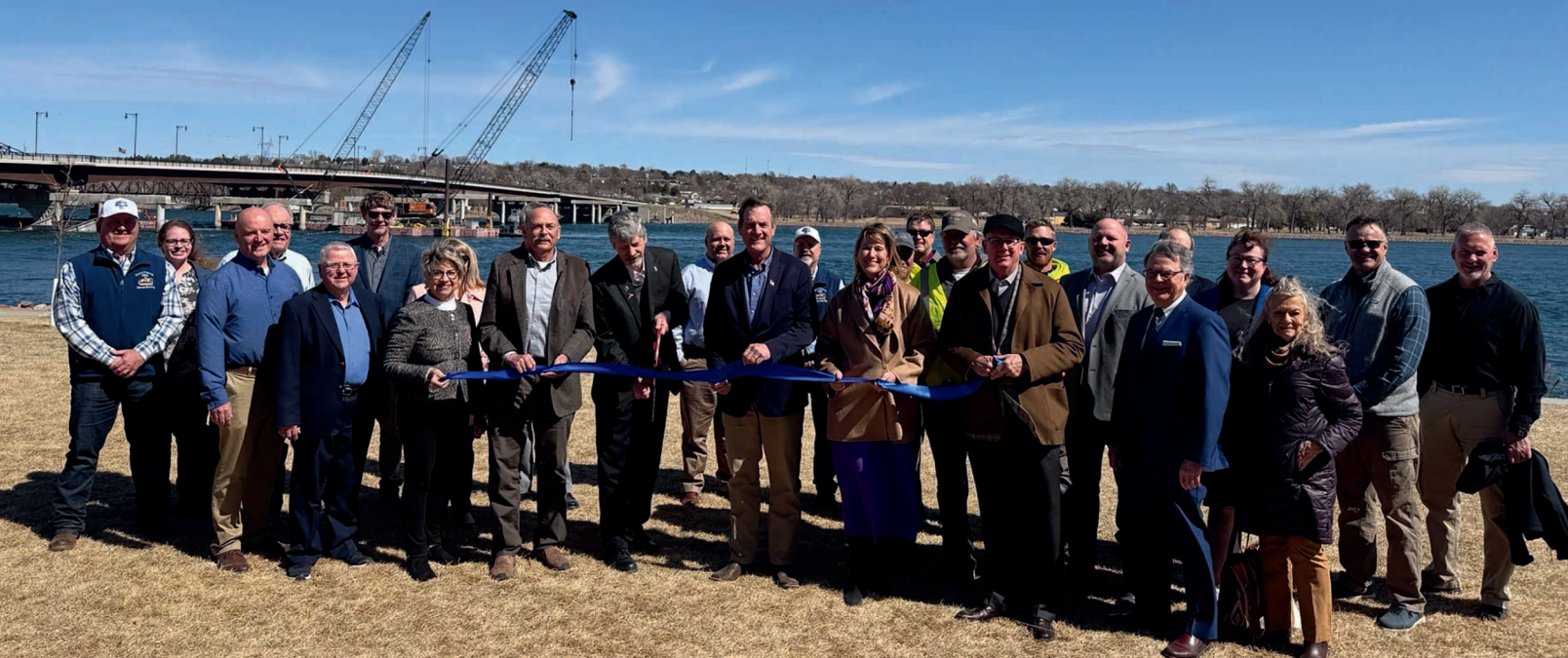
Local, state and federal officials celebrate the ribbon-cutting of the new Lieutenant Commander John C. Waldron Memorial Bridge, March 25, 2025.