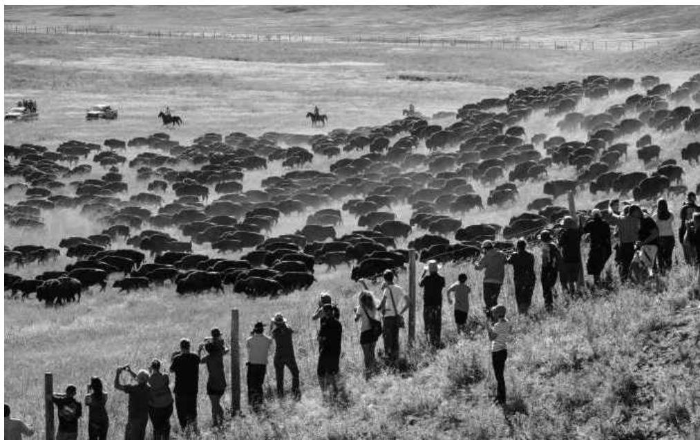
The Custer State Park Buffalo Roundup each September is popular with tourists and helps the state manage the bison that live in the park.

To learn more about the Custer State Park Bison Center, visit gfp.sd.gov/csp-bison-center/ .