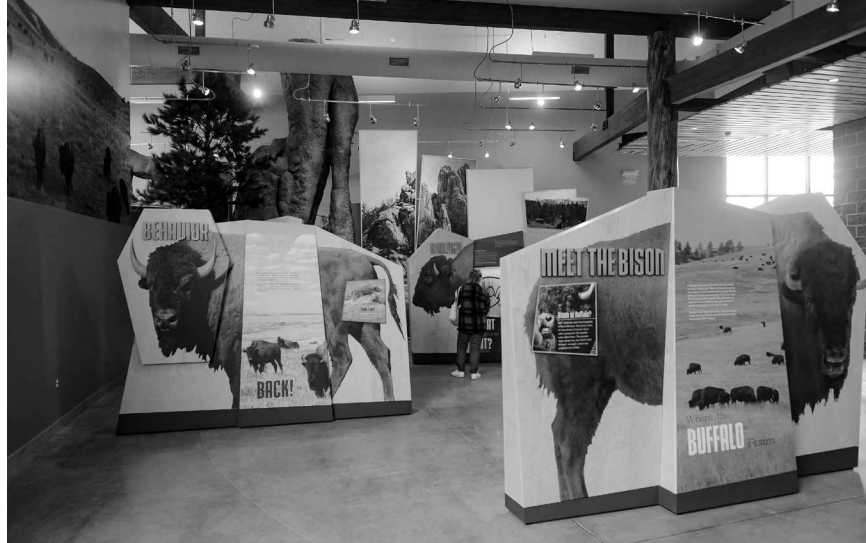
The Custer State Park Bison Center helps educate visitors about the history and importance of the herd of 1,400 buffalo that live in the park.

The biggest day of the year for the Bison Center comes in September during Custer State Park's annual Buffalo Roundup and Arts Festival. This year's event is scheduled for Sept. 28-30. The roundup itself is Sept. 29. Parking lots will open at 6:15 a.m. Mountain Time for people