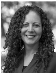
Miranda Boutelle Efficiency Services Group

A: The energy a residential well system uses depends on the equipment and water use. The homeowner is responsible for maintaining the well, ensuring drinking water is safe and paying for the electricity needed to run the well pump. Here are steps to improve and maintain your residential well and use less electricity.