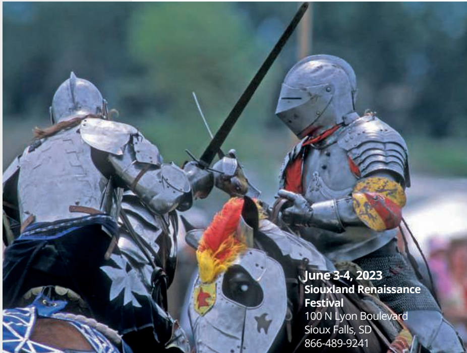
June 3-4, 2023 Siouxland Renaissance Festival 100 N Lyon Boulevard Sioux Falls, SD 866-489-9241

To have your event listed on this page, send complete information, including date, event, place and contact to your local electric cooperative. Include your name, address and daytime telephone number. Information must be submitted at least eight weeks prior to your event. Please call ahead to confirm date, time and location of event.