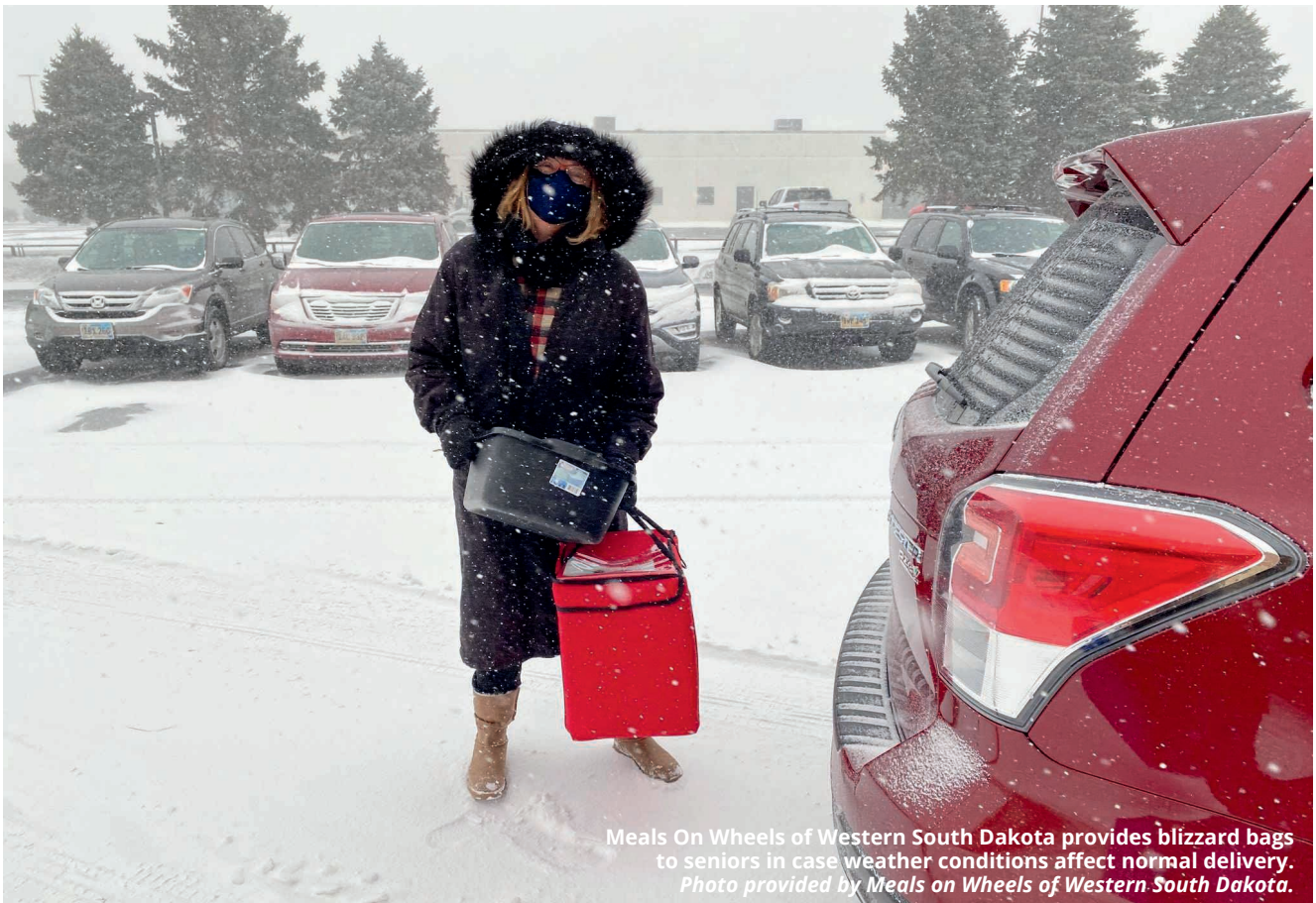
Meals On Wheels of Western South Dakota provides blizzard bags to seniors in case weather conditions affect normal delivery.

Anyone interested in getting service or helping with the cause can contact Meals on Wheels of Western South Dakota at (605) 394-6002.