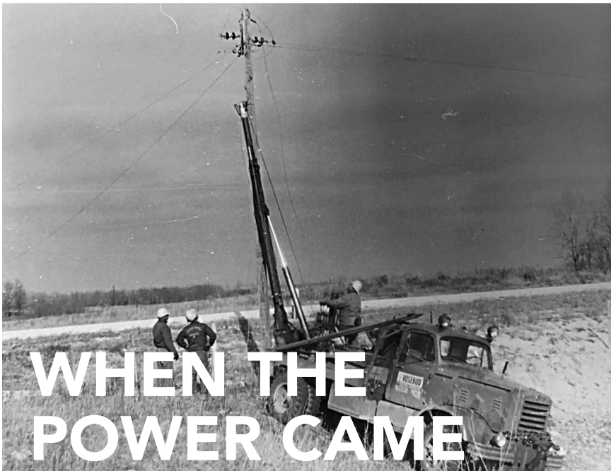
Rosebud Electric Cooperative providing power in the early days.