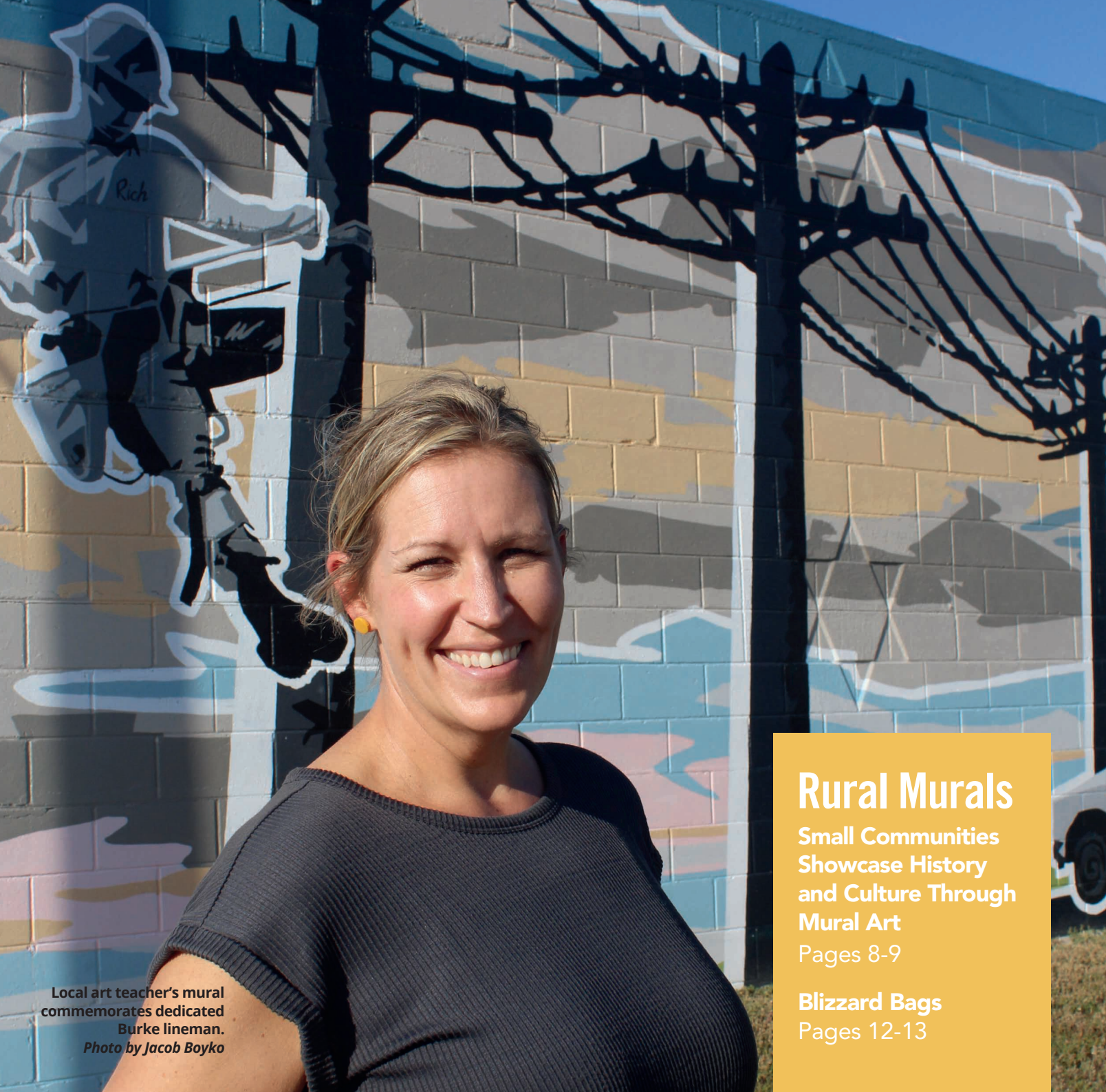
Local art teacher's mural commemorates dedicated Burke lineman.