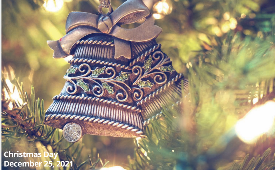
Christmas Day December 25, 2021

To have your event listed on this page, send complete information, including date, event, place and contact to your local electric cooperative. Include your name, address and daytime telephone number. Information must be submitted at least eight weeks prior to your event. Please call ahead to confirm date, time and location of event.