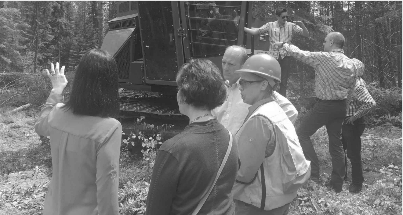
Leadership students take a field tour of a logging operation in northern Minnesota.